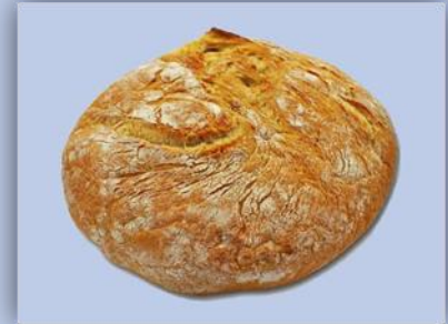
Farmers Bread (Bauernbrot)