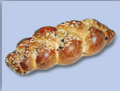
Sweet Raisin Bread (Rosinen-Hefezopf)