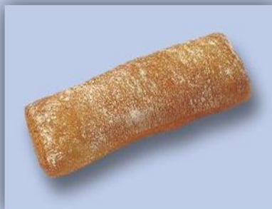
Ciabatta Bread Article# 081