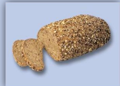
Five Seed Bread (Fünfkornbrot)