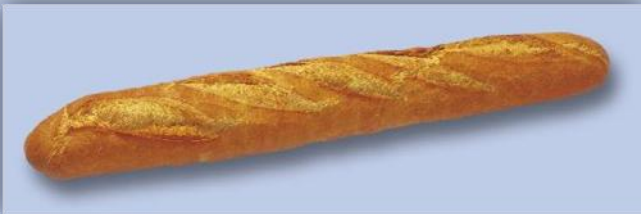
French Baguette Article# 013