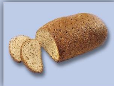
Spelt Bread (Dinkelbrot)