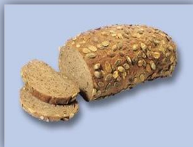
Pumpkin Seed Bread (Kürbiskernbrot)