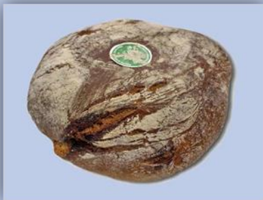
Ukrainian Bread (Ukrainisches Brot)