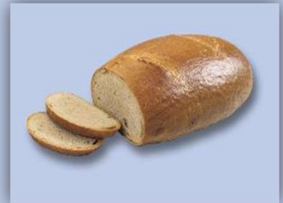
Vesper Wheat Mixed Bread (Weizenmischbrot) Article# 376