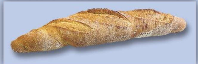
Stone Oven Onion Baguette (Steinofen-Zwiebel-Baguette) Article# 186