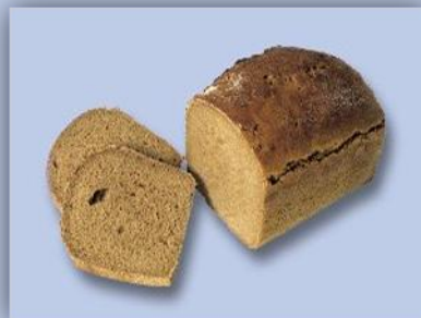
Tavrisheskiy Bread (Pflastersteinbrot)