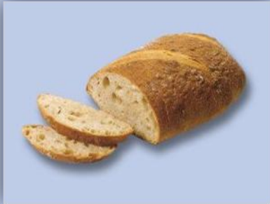
Crusty Farmers Bread (Rustikales Bauernbrot) Article# 349