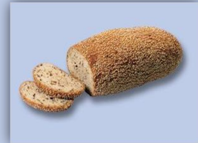
Three Seed Bread (Dreikornbrot)