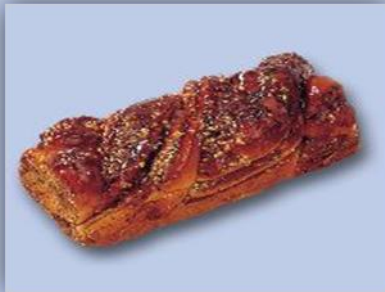
German Nut Bread Twist (Nussstriezel)